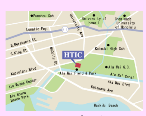
Location of HTIC

ISABMEC2014 is going to be held at HAWAI TOKAI INTERNATIONAL COLLEGE (HTIC) located at 2241 Kapiolani Boulevard, Honolulu, Hawaii 96826, U. S. A.